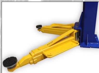
Extra large arm design with large diameter lift pad