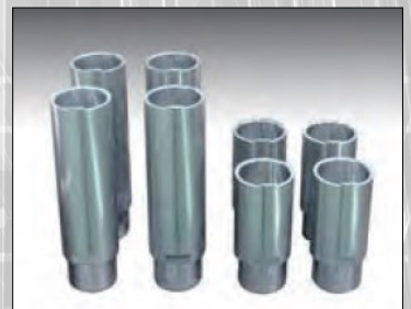
Supplied with 100mm 4WD extensions. 187mm availa- ble on request.