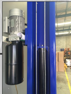
High quality, pre-stretched, high tensile cables