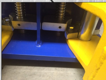
High quality arm locks machined from billet steel