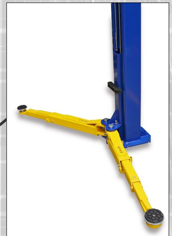
Triple expanding arms front and rear with built in tool trays