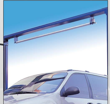
Padded roof top protection