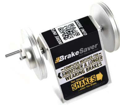
Free point of sale marketing program included!