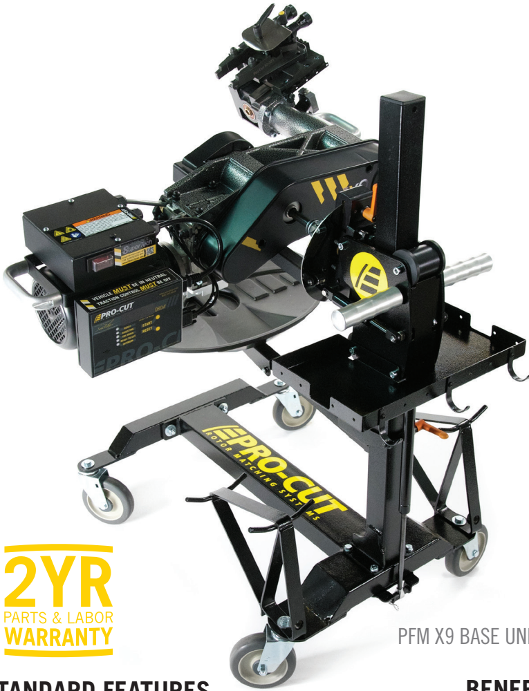
PFM X9 BASE UNIT